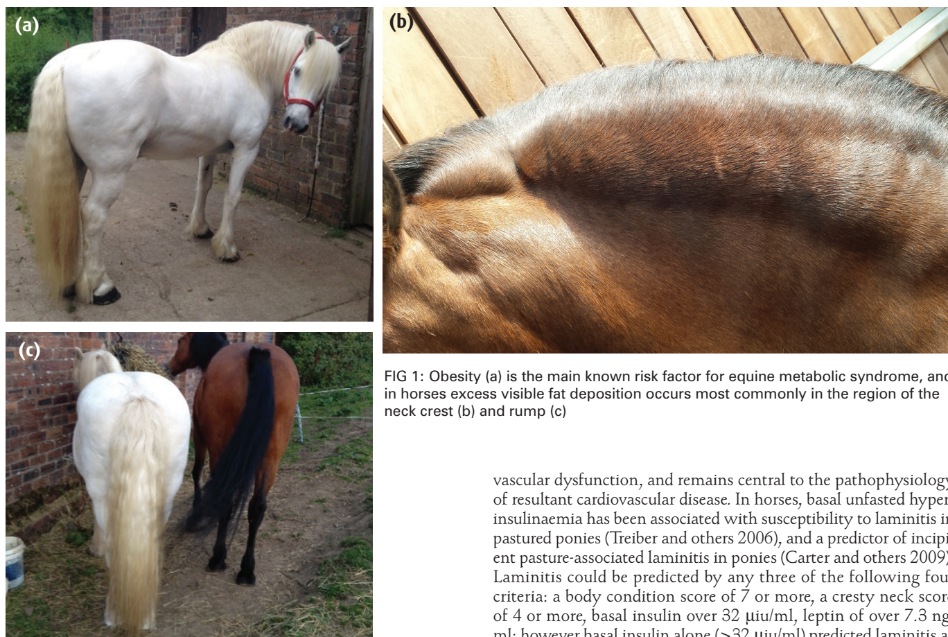
FIG 1: Obesity (a) is the main known risk factor for equine metabolic syndrome, and in horses excess visible fat deposition occurs most commonly in the region of the neck crest (b) and rump (c)

A small number of studies have attempted to tease out the possible role of fat in the development of EMS (Burns and others 2010). In horses, excess visible fat deposition occurs most commonly in the region of the neck crest and rump (Fig 1). Some researchers have suggested that neck crest adipose tissue is more active than omental adipose in horses, but the data are not conclusive (Burns and others 2010).